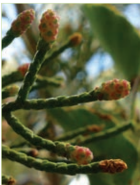
Manoa colensoi .