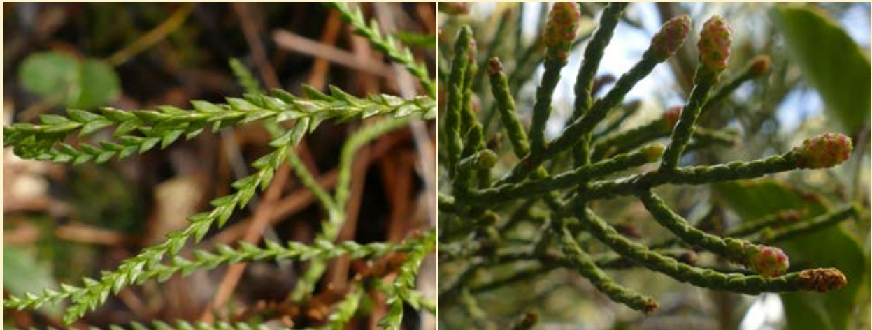
Manoao colensoi juvenile foliage (left), adult foliage and male cones (right).

The plant of the month for September is Manoao colensoi , the only Manoao species in the world, the genus being monotypic. The species is found in both North and South Islands from Te Pahi in the north to Te Anau Downs in the south. It is rare in the northern North Island, being confined mainly to the Volcanic Plateau, and is restricted to the wetter western areas of the South Island. The species is endemic to New Zealand and is currently listed as Not Threatened because it is still fairly widespread in the South Island, with no immediate threats, but has been heavily logged in the past for fence posts and house piles.