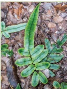
Parablechnum procerum