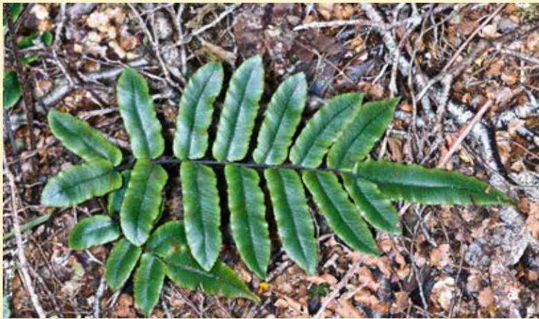
Parablechnum procerum .

Plant of the month for September is Parablechnum procerum or 'small kiokio', one of five Parablechnum species endemic to New Zealand. The species is widespread throughout the country from about Mangamuka forest south to the sub-Antarctic and Chatham Islands. It lives in a wide range of habitat types from coastal forest and scrub to sub-alpine tussock grassland. In the southern part of its range, it often is one of the dominant