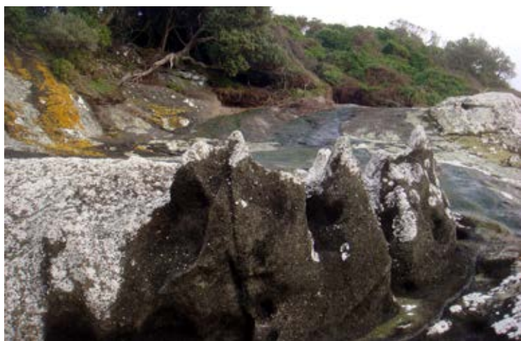
Fig. 3. Lichenfield on shore platform coastline leading from Te Outa to Whalers Bay, Rangatira. The lichen causing the white 'paint' is mostly Pertusaria graphica whilst the yellow lichen is Dufourea ligulata (a species which is usually coloured dark orange). Photo: P.J. de Lange.

With respect to the lichens, those of Rangatira are, with few exceptions, crustose, often drab species that are easily missed in the gloomy forest. It is on the exposed coastal cliff faces, shore platforms and rock outcrops of Rangatira where lichens, at least visually, dominate (Fig. 3). In particular, the white 'paint' of Pertusaria graphica forms a distinctive band on the rocks just above the spray zone (Fig. 3) and on the island's exposed cliff faces. In places, this is broken by the Dufourea ligulata (Fig. 3) a species which, depending on the degree of exposure, can be yellow, orange or very dark fiery orange. In