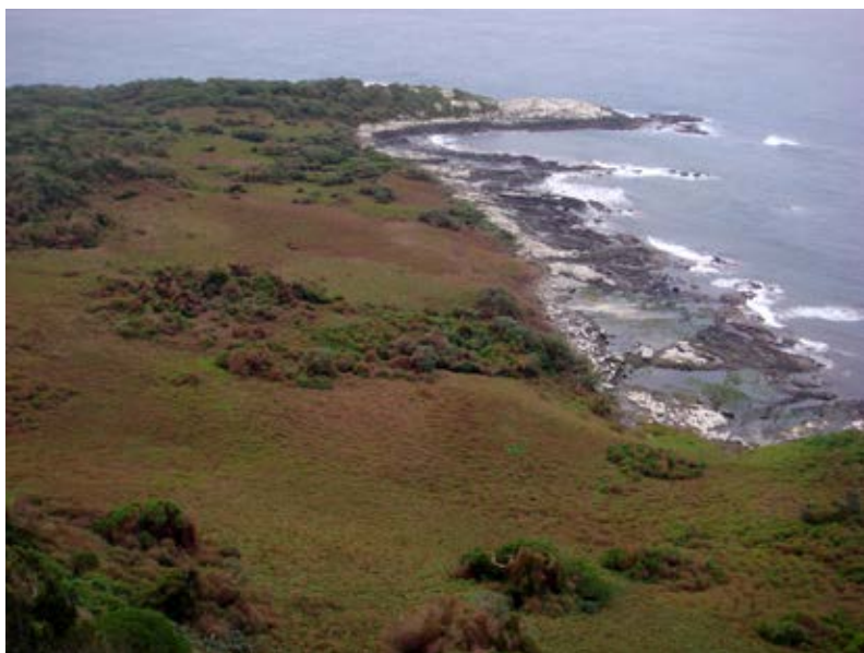
Fig. 2. North-eastern portion of Rangatira as seen from the Trig Station. Much of the flat expanse of vegetation is pohuehue ( Muehlenbeckia aff. australis ) vineland.

As Rangatira was once so extensively modified, the flora and vegetation of the island, though recovering, lacks the diversity of that seen in similar habitats on nearby Pitt Island. Of course, it's also true that the much smaller size of Rangatira limits the floral diversity—so you would expect less diversity. Nevertheless, following from the July 2015 survey, and working through the myriad fungal and plant collections housed in New Zealand herbaria, we can report an interim flora for Rangatira comprising 182 indigenous and 68 naturalised fern and flowering plants (including five hybrids and seven [possibly new to science] 'species'), one hornwort, 28 liverworts (one of which is naturalised to the Chatham Islands) and 50 mosses (including one naturalised to the islands). We also report four fungi and 119 lichens. Whilst we are pretty confident that the fern and flowering plant tally is accurate, more work is needed for the hornwort, liverwort and mosses – plant groups rarely collected by island visitors. Similarly, there will be more fungi on the island and, without doubt, many more lichens. Though the results of our four-day investigation are still being written up, a draft vegetation association map is now available for use. Copies are held by the Department of Conservation.