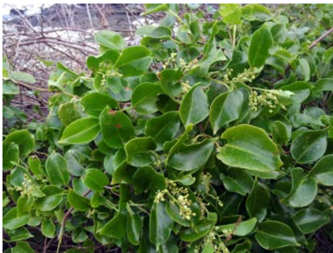
Fig. 1. Flowering plant (male specimen) of pohuehue ( Muehlenbeckia aff. australis ), Thinornis Bay, Rangatira.

The DOC 'Botanical' Survey was undertaken during the usual winter Chatham Island petrel ( Pterodroma axillaris ) burrow maintenance undertaken yearly during mid-winter on Rangatira. During the July 2015 visit, and aside from checking burrows, counting black robins ( Petroica traversi ) and other routine weed control and track clearing, it was intended to update the vegetation map for the island and investigate the succession within pohuehue ( Muehlenbeckia aff. australis ) vineland (Fig.1). Oddly, Rangatira, despite its global significance as the staging post for the recovery of the critically endangered black robin, has had little documentation of its flora. In part, this may be because, with an understandable focus on the conservation management of black robin and Chatham Island petrel, most shore parties have been ornithological rather than botanical. That said, there has been considerable research effort undertaken to investigate the vegetation succession of the island in the last 20 years. In particular, study has focussed on the pohuehue vineland that many experts