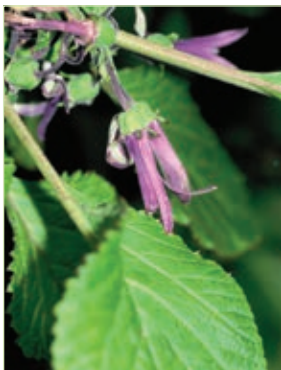
Lobelia physaloides .