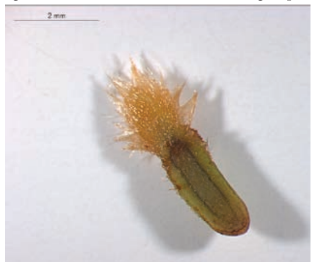
Embryonic axes of a kohekohe ( Dysoxylum spectabile) seed.