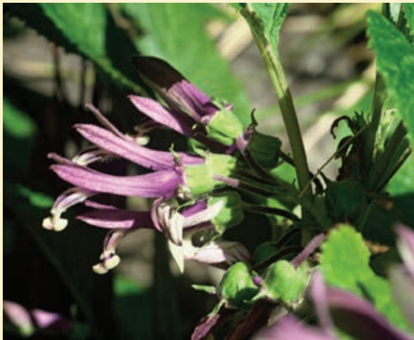
Lobelia physaloides .

with many small teeth along margin, reminiscent of a hydrangea, hence the common name, New Zealand hydrangea.