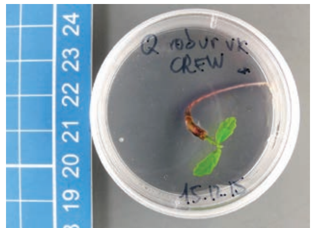
Quercus robur embryonic axes in culture medium showing root and shoot growth.

Cryopreservation (the process of using sub-zero temperatures to preserve living cells and tissues) offers a potential long-term storage solution for these species (Walters et al., 2013; FAO, 2014; Pritchard et al., 2014). During cryopreservation, tissues, sometimes protected with cryopreservants, are cooled