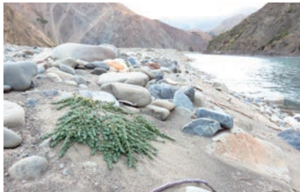
Dysphania pusilla growing beside the Clarence River.

Until recently, Dysphania pusilla , or pygmy goosefoot, had not been confirmed in the wild for 56 years. Its last confirmed location was on gravel ballast in railway yards in