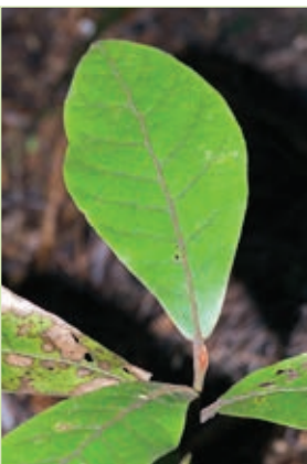
Beilschmiedia tarairi.