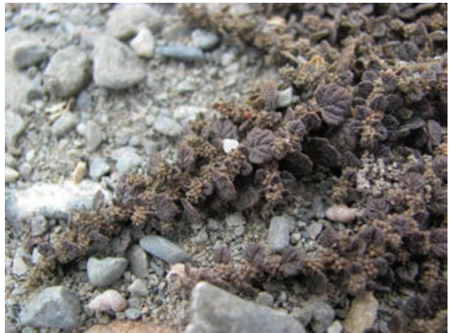
View of the Ruataniwha wetlands (left) and a close-up of Dysphania pusilla there (right).