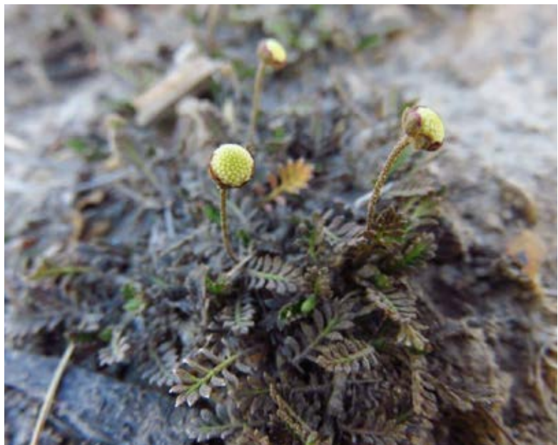
Leptinella filiformis before rain (left,) and after rain (right,).