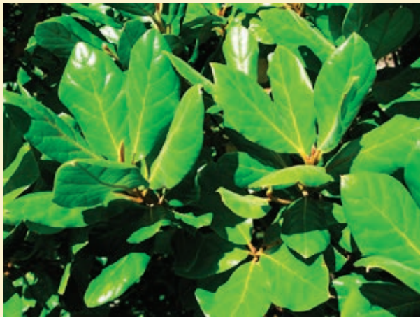
Beilschmiedia tarairi .

Plant of the month is Beilschmiedia tarairi (taraire). Taraire is a canopy tree in lowland and lower montane forests of the North Island, most commonly north of Auckland. As it grows north of 38°S latitude, it is a common companion of kauri ( Agathis australis ) and pohutukawa ( Metrosideros excelsa ), as well as puriri ( Vitex lucens ).