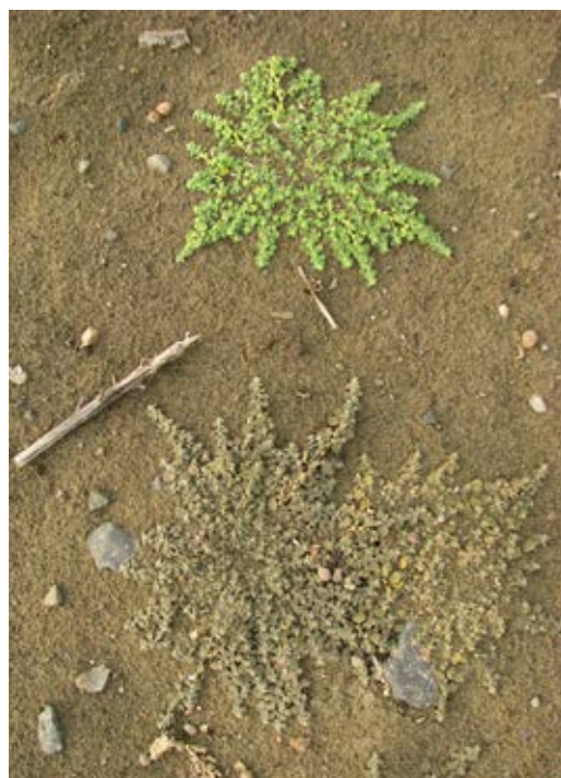
Both colour morphs of Dysphania pusilla growing side by side at the Clarence oxbow.

de Lange, PJ; Rolfe, JR; Champion, PD; Courtney, SP; Heenan, PB; Barkla, JW; Cameron, EK; Norton, DA; Hitchmough, RA. 2013: Conservation status of New Zealand indigenous vascular plants, 2012. New Zealand Threat Classification Series 3 . Department of Conservation, Wellington. 70 p.